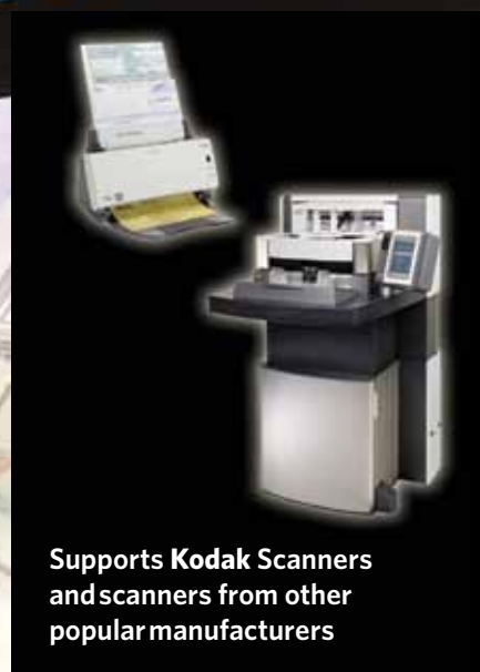
Supports Kodak Scanners and scanners from other popular manufacturers