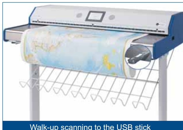
Walk-up scanning to the USB stick

The cutting edge camera technology, consisting of a dust-protected, hermetically sealed camera box holding CCD systems using a patented stitching procedure, delivers an optical resolution of 1200 x 600 dpi.