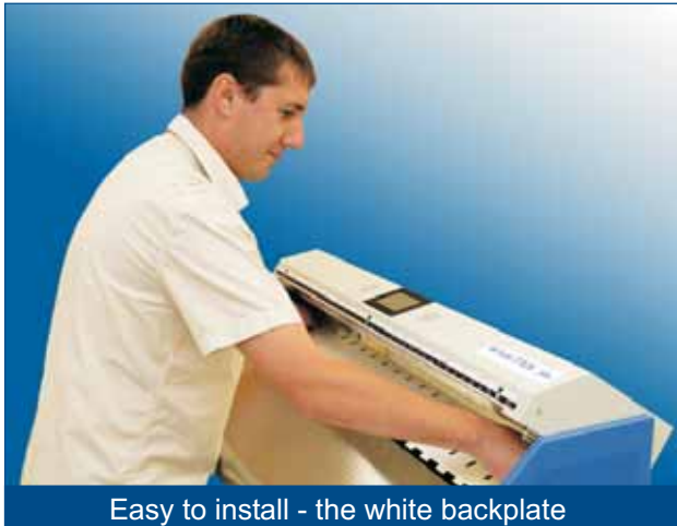
Easy to install - the white backplate

Effective and cost-efficient scanning of transparent documents