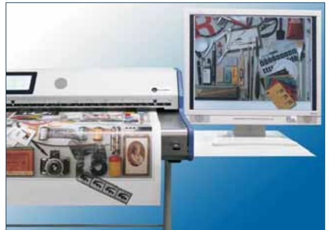
High resolution scan results of detailed documents