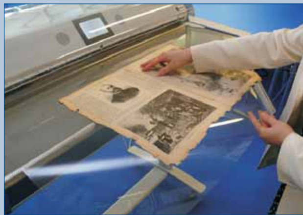
Gentle scanning of valuable documents

Automatic document size recognition allows operators to pass sensitive documents through the middle of the scan area, protecting documents from any damage.